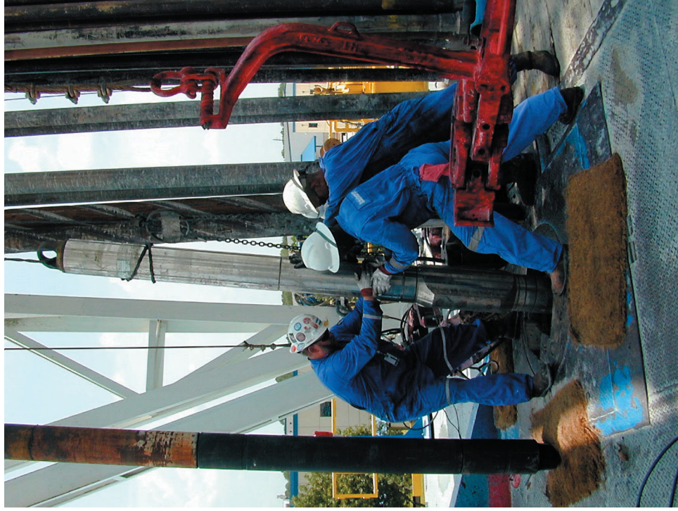
Assembly of the RAB Coring Tool during an early test in Texas.