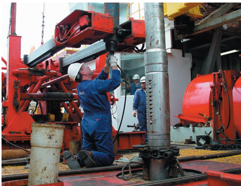
Assembly of the RAB Coring Tool aboard the JOIDES Resolution .